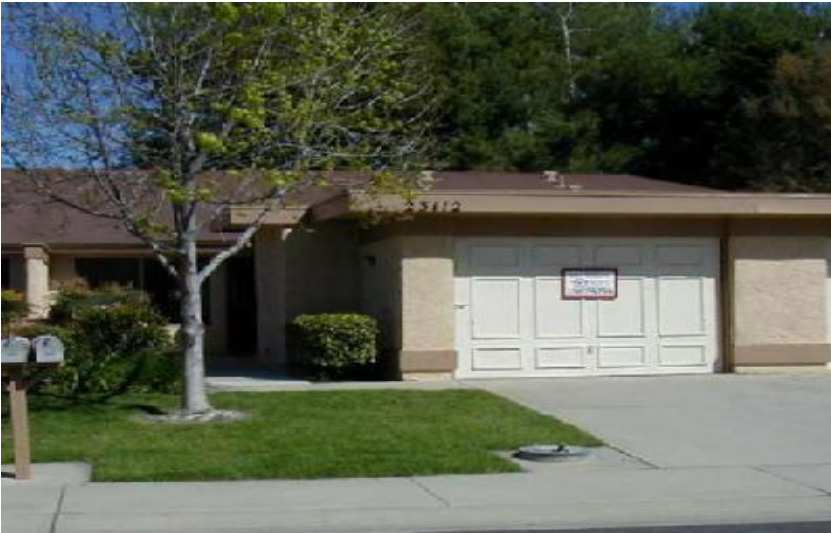
23112 Village 23 Camarillo, CA 93012-7603