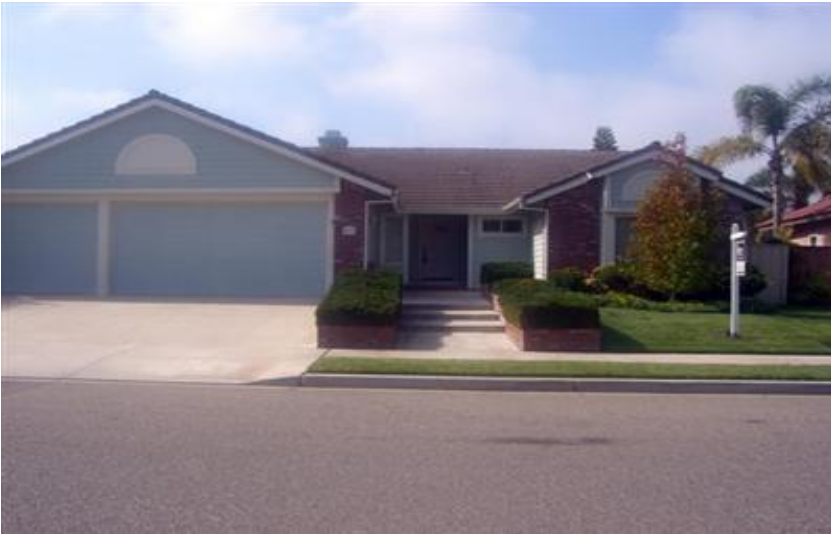
811 Coronado Pl Oxnard, CA 93030-8712