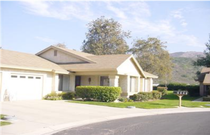
30029 Village 30 Camarillo, CA 93012